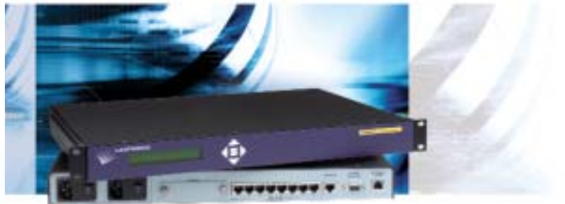
SCS820/1620 Quick Start Guide